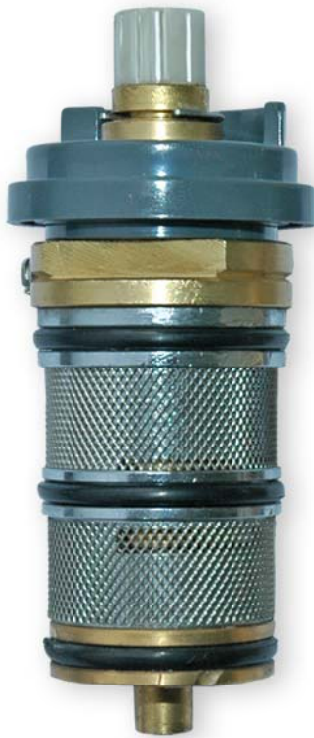
Model No 12