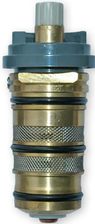
Model No 6