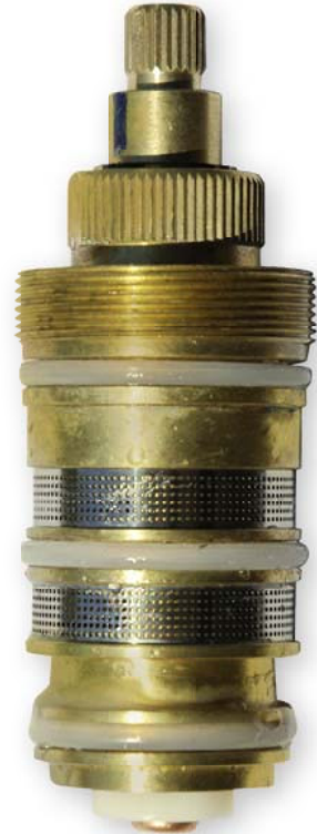
Model No 8

The Thermostatic cores in our steam shower cabins differ depending on the type of assembly you have. We are not always able to determine which core model you require even by the model number of your cabin, as the manufacturers can, and do make changes to improve the product range.